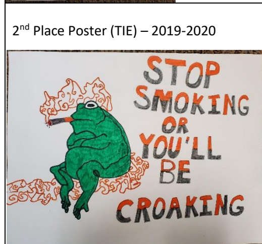
2 nd Place Poster (TIE) – 2019-2020