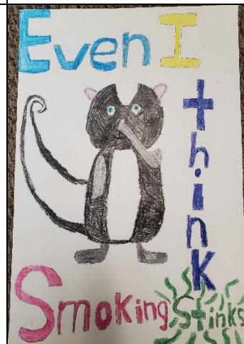
3 rd Place Poster 2019-2020