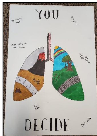
1 st Place Poster 2019-2020