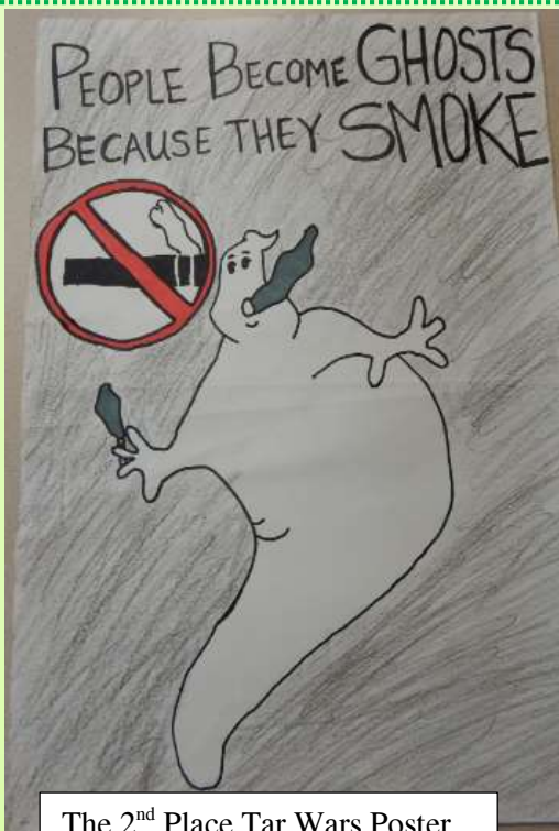
The 2 nd Place Tar Wars Poster (above), by Kighter Wortmann.