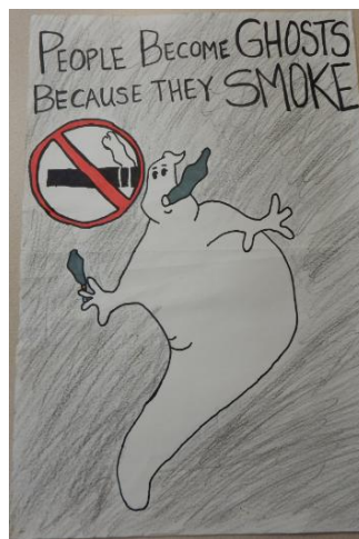
2 nd Place Poster for 2018-2019