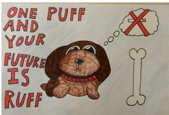
1 st Place Poster for 2018-2019